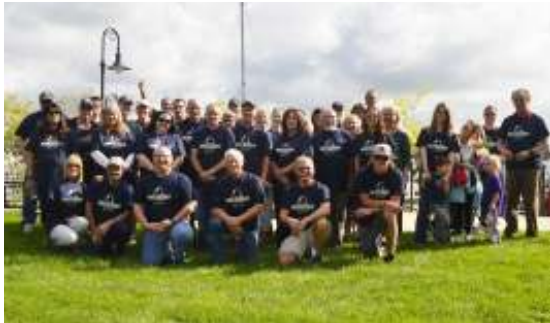
2016 Recovery Walk