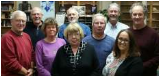
October 2016 BASES Board of Directors